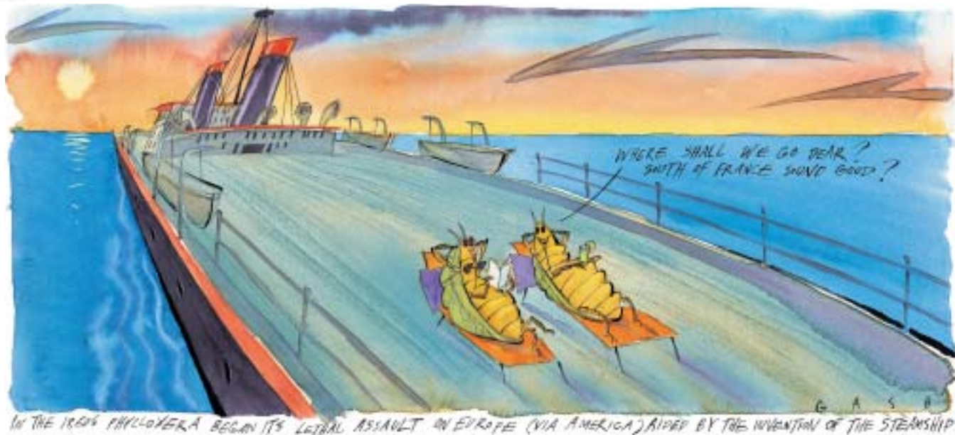
IN THE 1860s PHYLLOXERA BEGAN ITS LETHAL ASSAULT ON EUROPE (VIA AMERICA) AIDED BY THE INVENTION OF THE STEAMSHIP