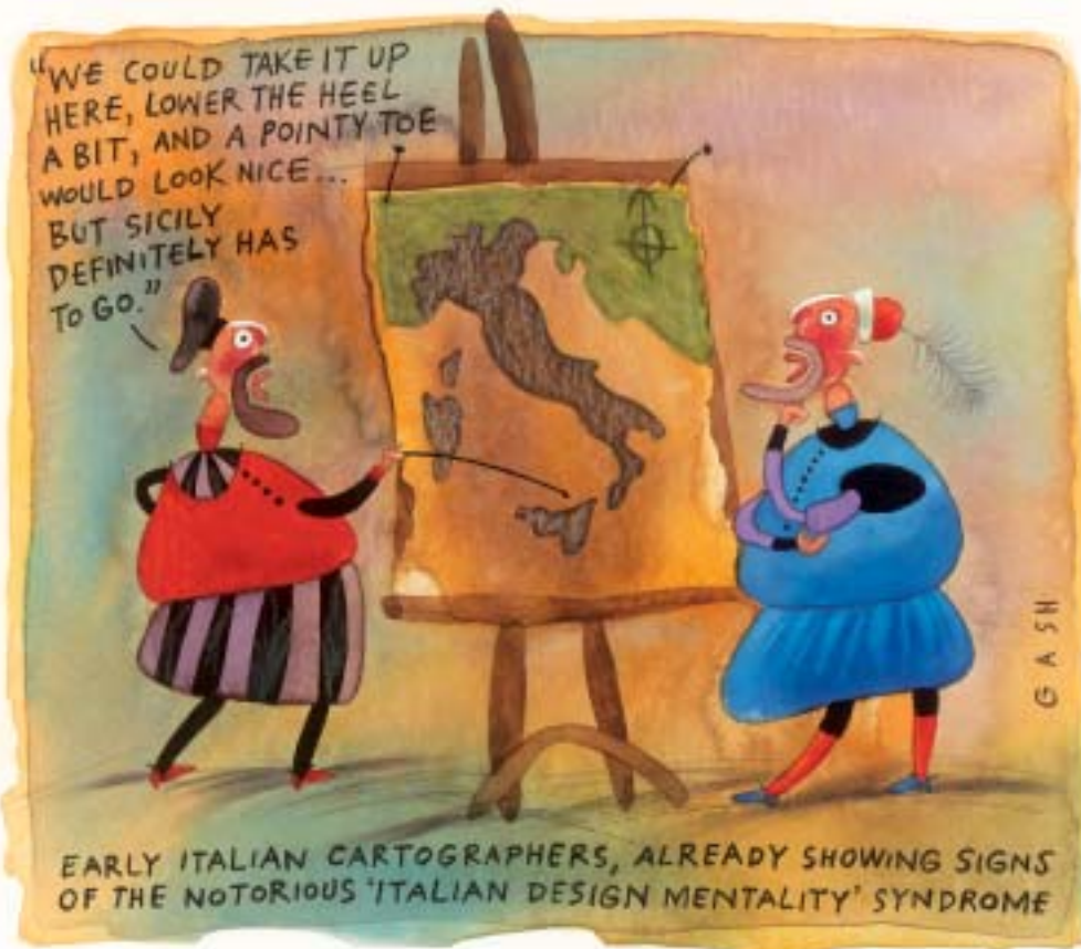
EARLY ITALIAN CARTOGRAPHERS, ALREADY SHOWING SIGNS OF THE NOTORIOUS 'ITALIAN DESIGN MENTALITY' SYNDROME