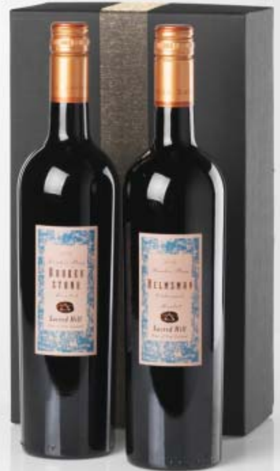
Sacred Hill Helmsman Cabernet Merlot 2004 Sacred Hill Brokenstone Merlot 2004