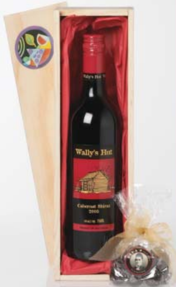
Wally's Hut Cabernet Shiraz Dida's Chocolate Macadamias