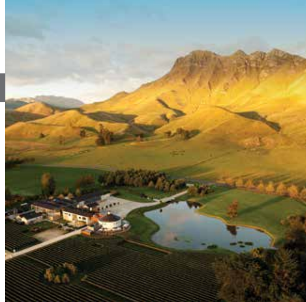
C R A G G Y R A N G E W I N E R Y