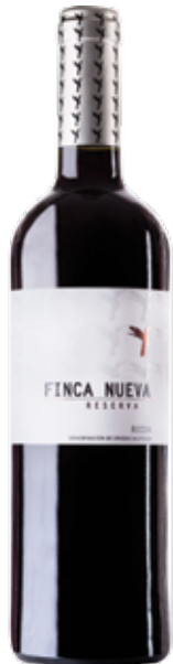
89813 FINCA NUEVA RIOJA RESERVA 2010