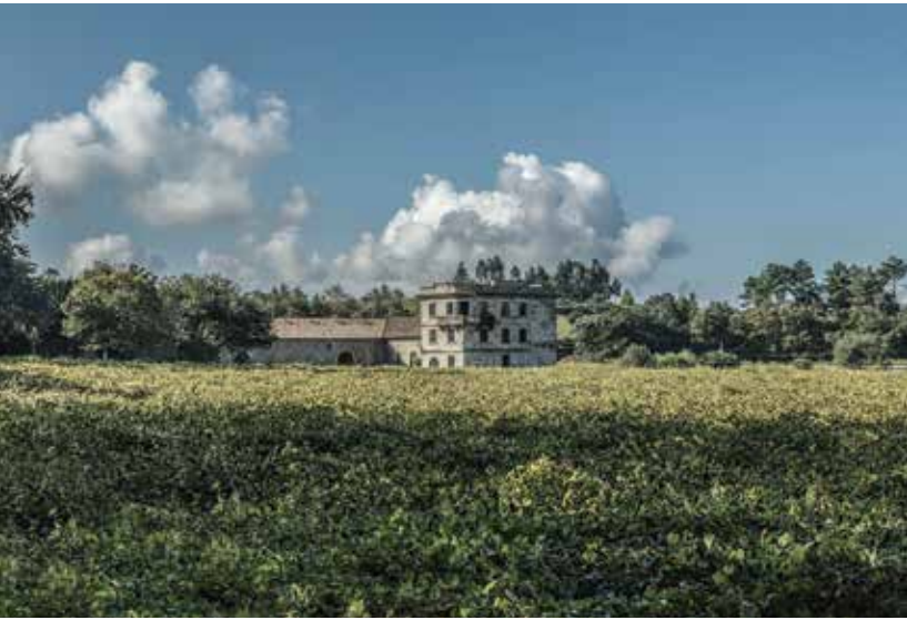
PAZO DE BARRANTES