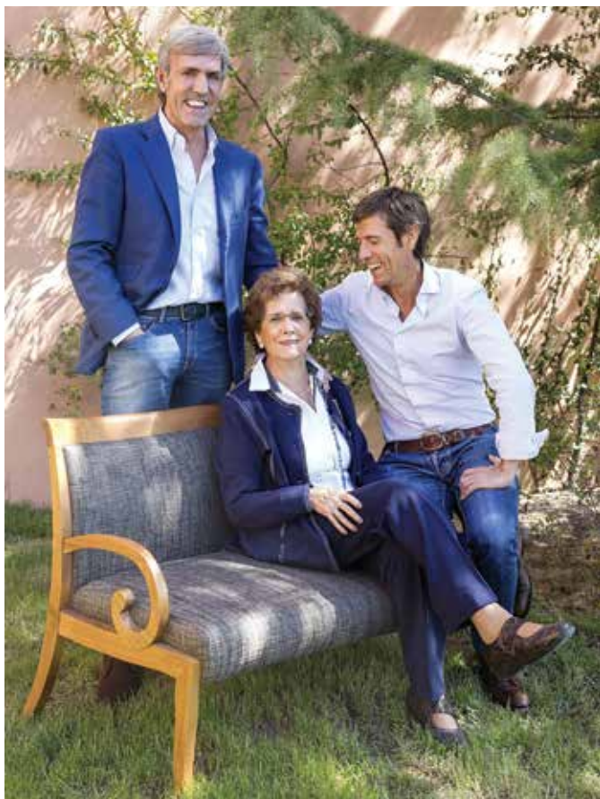
LA FAMILIA MORO