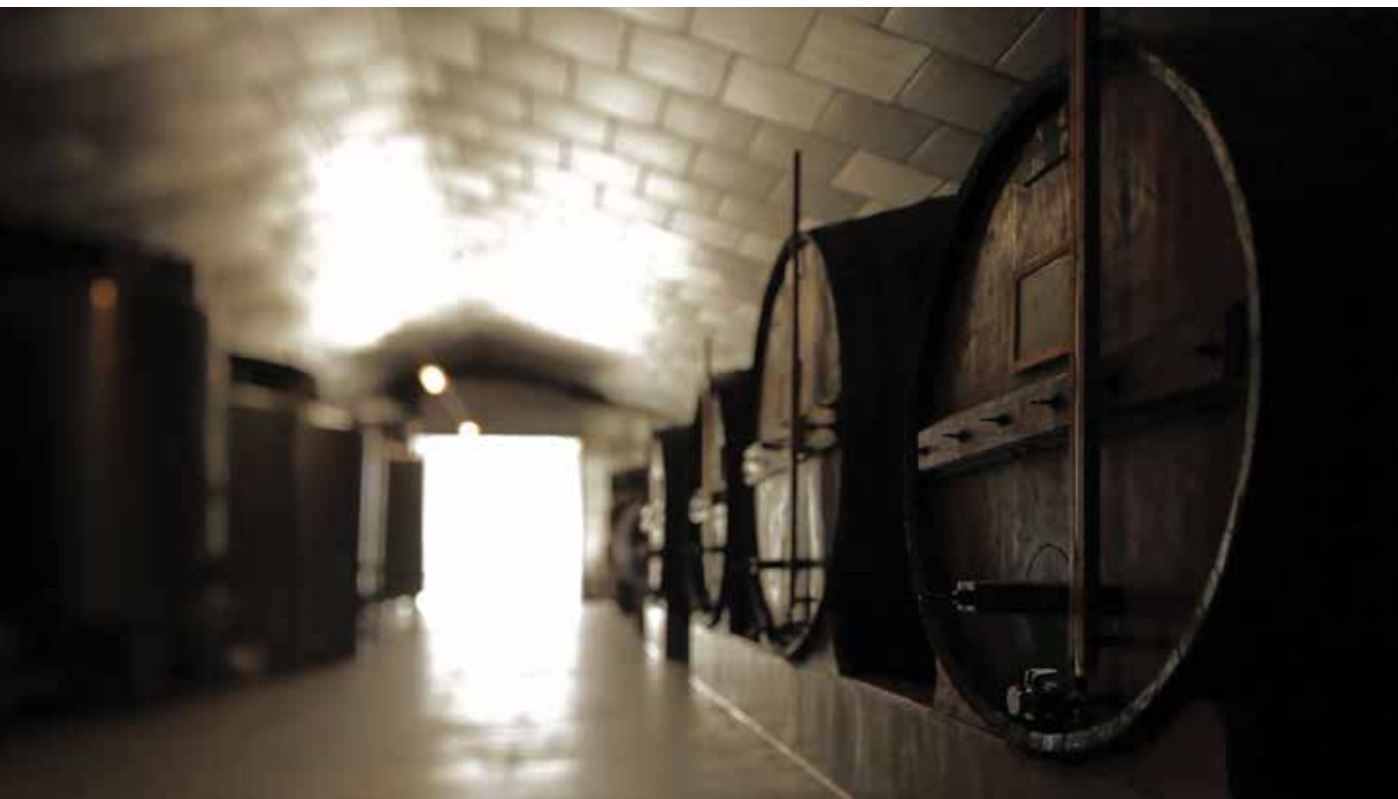
QUINTA DO NOVAL