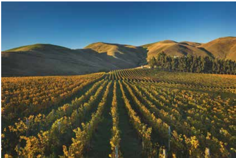
CLAYVIN VINEYARD, MARLBOROUGH

Giesen have been leasing part of Clayvin since 2003. In 2011 they purchased it outright. Remarkably, they don't keep all the grapes to themselves, with Te Whare Ra and Fromm also accessing fruit from the site. Try any of these three wines and you'll be sure to conclude that this Marlborough hillside produces exceptional, world-beating Pinot Noir. An increase in plantings on Marlborough's hills and in its more marginal areas can only mean that there is more to come.