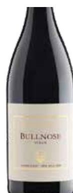
TE MATA HAWKES BAY 19127 BULLNOSE SYRAH 2018 $69.99

The latest release of the iconic Bullnose. A dark ruby colour with aromas and flavours of violets, black cherry liqueur and spice, intermingled with notes of prune and raspberry. The rich, full flavoured palate is graced with velvety, even tannins.