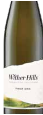
WITHER HILLS MARLBOROUGH 19958 PINOT GRIS 2019 $14.99

The stony soils of the Awatere Valley and some skilled winemaking generate a wine displaying a wealth of elegance, superb purity and a sharp minerality. A good example of what the Awatere is all about and a fitting tribute to the signature style of Vavasour.