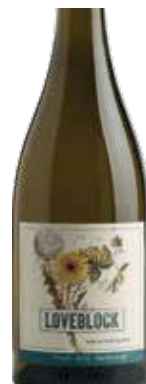
LOVEBLOCK MARLBOROUGH 14781 PINOT GRIS 2019 $19.99

Lovelock's organic wines are drinking brilliantly. Their Pinot Gris displays delicate aromas of pear and melon on a lingering palate of beautiful fruit underscored with a lovely texture and linear acidity.