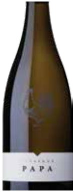
VAVASOUR MARLBOROUGH 12178 PAPA SAUVIGNON BLANC 2018 $32.99

The stony soils of the Awatere Valley and some skilled winemaking generate a wine displaying a wealth of elegance, superb purity and a sharp minerality. A good example of what the Awatere is all about and a fitting tribute to the signature style of Vavasour.