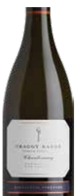
CRAGGY RANGE HAWKES BAY 11222 KIDNAPPERS VINEYARD CHARDONNAY 2019 $24.99

Fruit from the cool but sunny Kidnappers Vineyard in Te Awanga delivers intense Chardonnay flavours in a precise, fresh, mineral-tinged palate with ripe citrus characters and subtle oak highlights. An early-drinking Chardonnay that'll match well with Christmas Turkey.