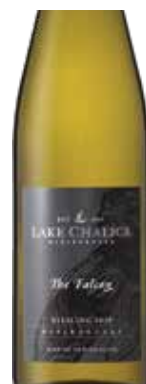
LAKE CHALICE MARLBOROUGH 14797 THE FALCON RIESLING 2019 $16.99

This off-dry Riesling is outstanding value. Made in a Spätlese style, it is decidedly aromatic. Floral, lime and mandarin notes are nudged with a flick of spice, the sustained fruit characters balanced by a mineral twist. Delicately restrained, with nicely balanced acidity.