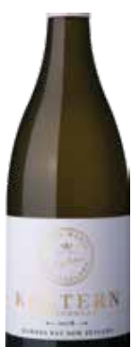
VILLA MARIA HAWKES BAY 19538 KELTERN CHARDONNAY 2018 $74.99

The French term terroir is a handy descriptor for this; it's all about the vineyard site and its unique characteristics that transfer seamlessly into the glass. Delicate floral, flint and stonefruit aromatics introduce a refined and understated palate with great length.