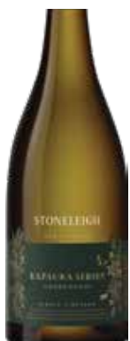
STONELEIGH MARLBOROUGH 12080 RAPAURA CHARDONNAY 2018 $21.99

From Marlborough's stony Rapaura sub-region, where peachy Chardonnays with a dash of creamy oak reign supreme. Subtle melon and tropical fruit notes combine with toasty oak aromas, the stonefruit flavours bedded on a rich and creamy palate with layers of complexity.